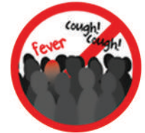
Stay at home, avoid contact with crowds