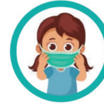
Wear a mask if you are unwell