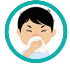
Cover your mouth with tissue while sneezing or coughing