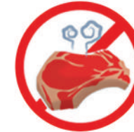
Eat only thoroughly cooked food