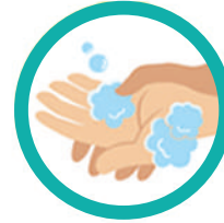
Wash hand regularly with water & soap or hand sanitizer